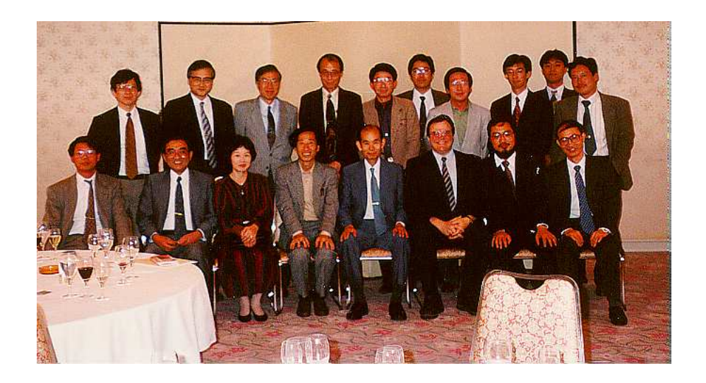
Figure 2.4: Some of the organization committee at the 1993 Nagoya IJCNN. Can you find the round-eyes?