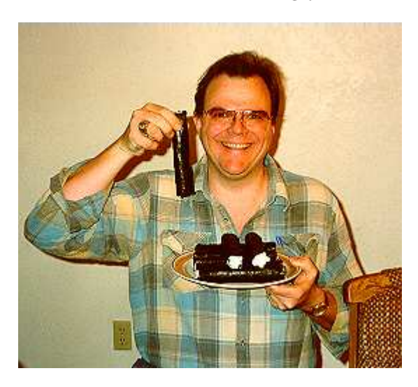
Figure 2.5: Me making rubbery sushi.

afraid of using raw fish purchased at Safeway for my sushi, so I bought a couple cans of cooked sardines - packed in fresh spring water. My sushi, for some reason, was about three times the diameter of normal sushi. Because I used warm rice, the seaweed became rubbery. Not even Jeremiah liked it. I ended up eating it all as a matter of pride. I dont make sushi anymore.