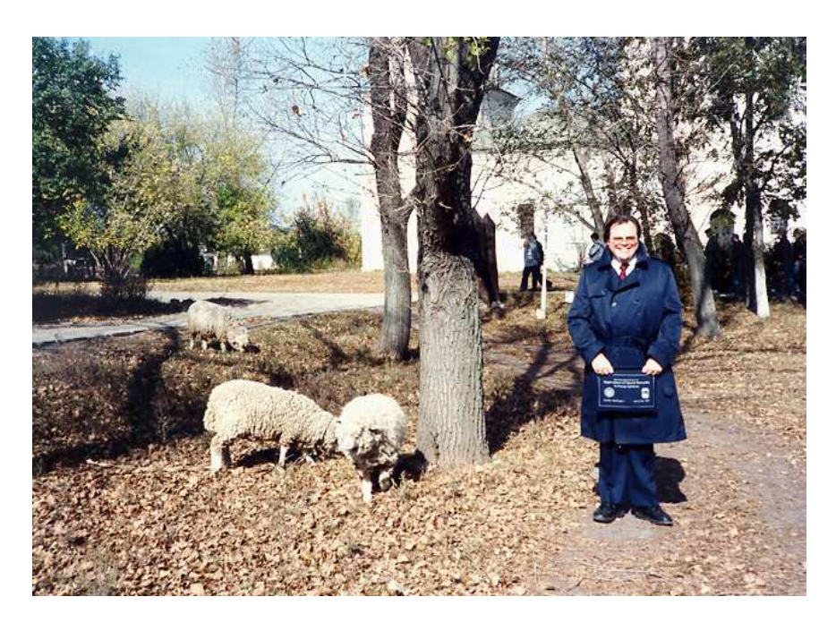
Figure 2.9: Me and some sheep on the Rostov countryside. (I'm on the right).

The boat docked, and we all deboarded. We formed a loose line, and walked about a half a mile to see a Russian church in the middle of restoration. The countryside was great. There were sheep and goats and old Cossack buildings. Two older ladies, who sat on a bench outside of a barn, were living caricatures of Russia, with their head scarves, multi layers of sweaters and chubby dome-like figures. I took their picture. They looked up and said something. Dmitry, who was with me, said something back. We continued to walk down the path and Dmitry explained, 'They asked why we were taking their picture. They said they have nothing.'