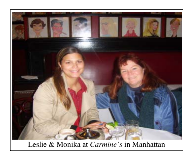
VIII. LAST THOUGHTS

Marilee and I'll be back in Seattle from December 27 through the first week of January.